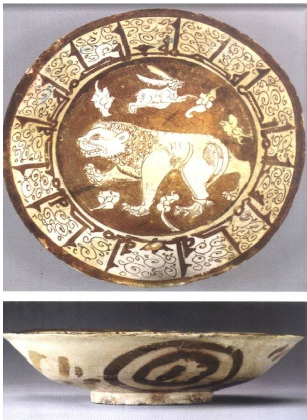
Fig. 1 (by Oliver Watson)