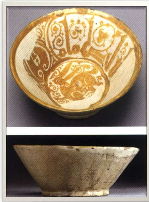
Fig. 4 (by Oliver Watson)

Ahl al-Kitab or the people of the book were one of the Fatimids' magical devices in securing their existence in Egypt, the heart of the Fatimid world. Being minorities in Egypt during the Fatimid era, the Jews and the Christians were, in most times, very well treated by the Fatimids who regarded Ahl al-Kitab as a very effective human device in their conflict with the Sunni community of Egypt. Accordingly, it is not surprising to find many pottery products, dating back to the Fatimid era exhibiting Christian motifs. The next gorgeous bowl is a good example of this artistic trend. It is a Fatimid masterpiece in Victoria and Albert museum. The bowl's fabric is fritware with an overglaze decoration; it roughly dates back to the period between the 11 th and the 12 th centuries. The central part of the bowl displays a human figure, who is clearly a