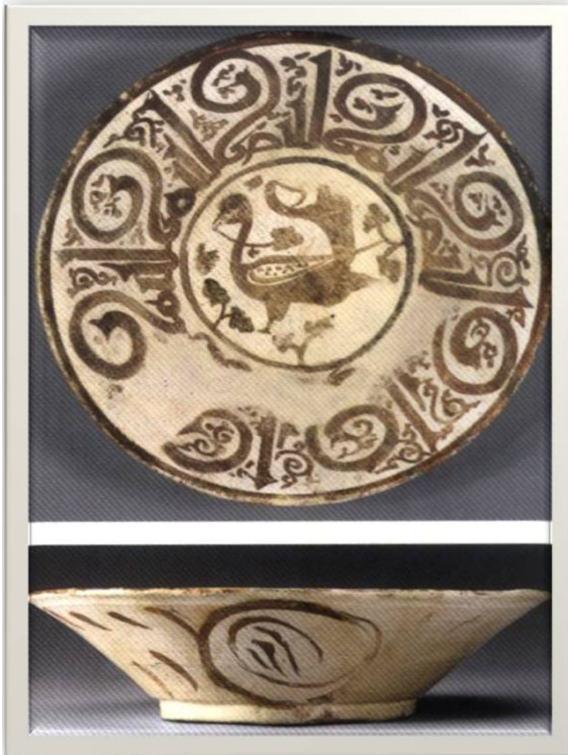
Fig. 3 (by Oliver Watson)

The rabbit was one of the predominant animal motifs in the Fatimid art. The museum of Islamic arts in Cairo and Kuwait national museum display a wide variety of Fatimid pottery decorated with the rabbit. The rabbit, as an animal motif, was used during the Coptic era in Egypt as a symbol of the spirit 27 , while in Islamic art it